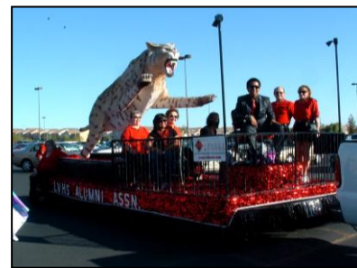
LVHS Alumni (above) and current LVHS students (below) at Homecoming

How great it was to be able to participate in the LVHS Homecoming Parade and halftime activities last October! The Wildcat Float was a big hit with the students, and alumni who participated had a really memorable time! We plan to participate again next October.